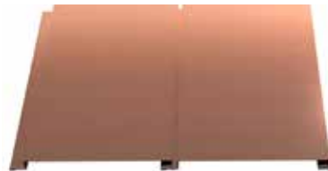
— Western Reveal® - 1"