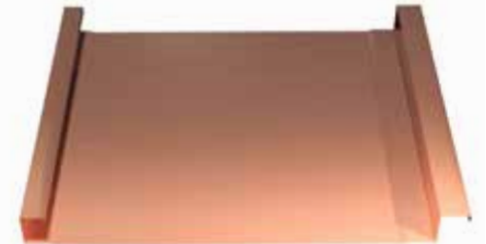
— MS2® Mechanically Seamed - 2" Deep