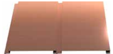
— Western Reveal® - 3"