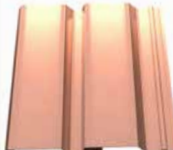
— Western Wave® - 8.0"