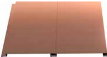
— Western Reveal® - NR