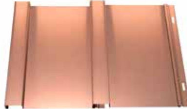
— Board and Batten Metal Siding