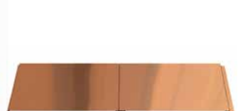
— T-Groove® - 1" Deep

Phoenix: ☎ (602) 495-0048 ✉ sales@westernstatesmetalroofing.com | Washington: ☎ (509) 418-2833 ✉ washington-wsmr@westernstatesmetalroofing.com