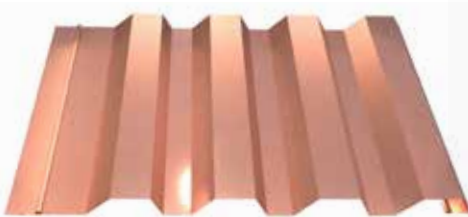
— Western Wave® - 16.0"