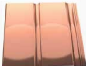
— Western Wave® - 12"