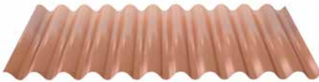
— 7/8" Corrugated