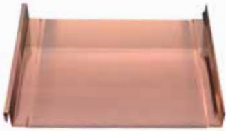
— Western Lock® Standing Seam

We specialize in Copper metal roofing, wall panels, coil, and flats. Our coil and flats are made from 3/4 hard copper. This allows for an easier panel to roll form and with less oil canning.