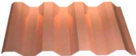
— Western Rib® (7.2 Panel) - 1.5" Deep