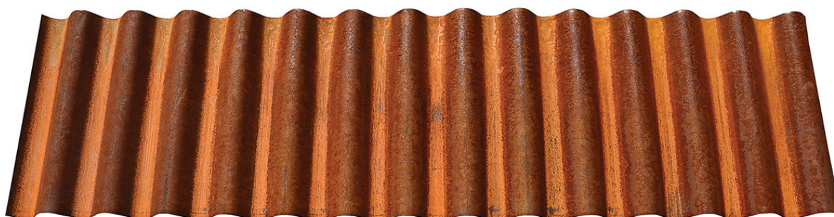
Shown in Bare Steel

***Material does not arrive pre-rusted. Panel will rust naturally with exposure to the weather. Use galvanized or stainless steel screws with a painted brown screw head for installing the panels.