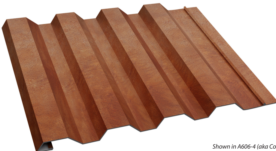
Shown in A606-4 (aka Corten®)

***Material does not arrive pre-rusted. Panel will rust naturally with exposure to the weather. Use stainless steel screws with a painted brown screw head for installing the panels.