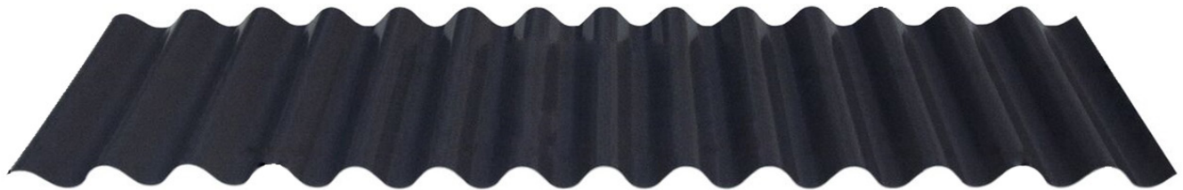
Shown in Dark Bronze