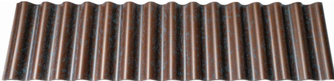
Shown in Streaked Blackened Copper